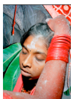
Sita Praying For Victory, 2019 41 x 60 cm