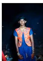
Watching The Dead Go 3, 2019 41 x 60 cm