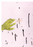
Dragonfly, 2019 41 x 60 cm