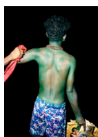
Green Soldier, 2019 120 x 175 cm