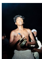
The Gong, 2019 120 x 175 cm