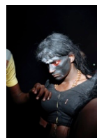
The Dark Knight, 2019 120 x 175 cm