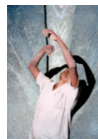
Rewind, 2018 41 x 60 cm