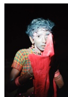
Eye Wide Open, 2019 120 x 175 cm