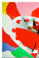
The Dragon, 2019 41 x 60 cm