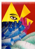
Parallel_Universe, 2018 41 x 60 cm