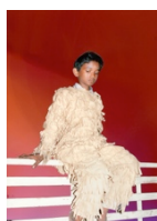
Hanuman Soldier, 2018 41 x 60 cm