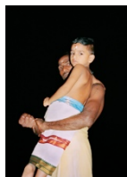
Father And Son, 2019 120 x 175 cm