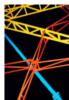
Ladders, 2019 120 x 175 cm