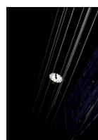
Midnight, 2019 120 x 175 cm

All works are Digital C-type on Fujiflex Hi Reflexion paper or Collage on Digital C-type on Fujiflex Hi Reflexion paper