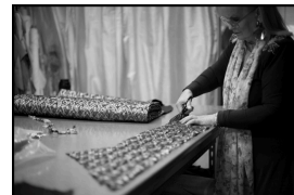
Droit fil, Melbourne, 2020 390mm x 530mm $425 framed $225.00 unframed