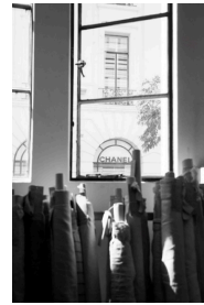
Ouverte, Melbourne, 2020 930mm x 670mm $675.00 framed $365 unframed