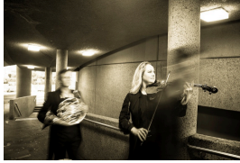
Symphonique, Melbourne, 2022 390 mm x 530 mm $425.00 framed $225.00 unframed