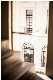
Juliette, Melbourne, 2020 930mm x 670mm $675.00 framed $365.00 unframed