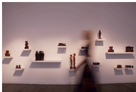
Cachée, Melbourne, 2020 Artist: David Hirst – Faceless People, December 2020 - fortyfivedownstairs gallery 670mm x 930mm $675.00 framed $365 unframed