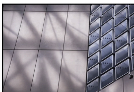
Géométrique, Melbourne, 2020 670mm x 930mm $675.00 framed $365.00 unframed