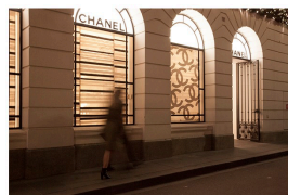
Linéaire, Melbourne, 2020 390mm x 530mm $425 framed $225.00 unframed