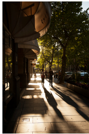
L'heure Dorée, Melbourne, 2020 930mm x 670mm $675.00 framed $365.00 unframed