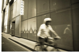
Réflexions, Melbourne, 2020 670 mm x 930 mm $675.00 framed $365.00 unframed