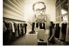
Alphaville, Melbourne, 2020 670 mm x 930 mm $675.00 framed $365.00 unframed