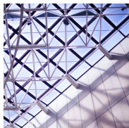
Passion triangles, Melbourne, 2020 300mm x 300mm $300 framed $200 unframed