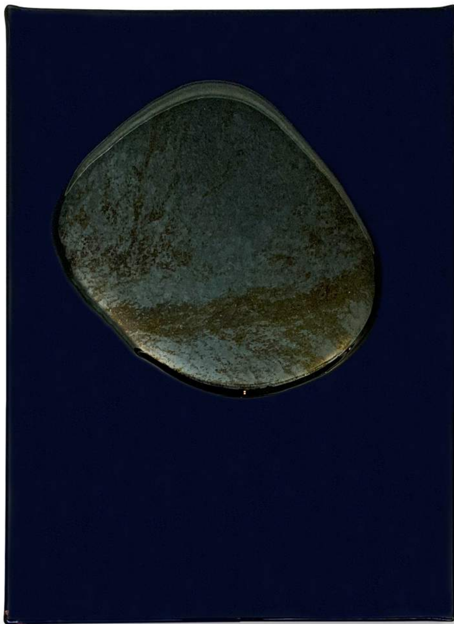
Emma Borland Form 18 2022 fused Oceanside and Youghiogheny glass, mirrored 41 x 31 cm $3,500