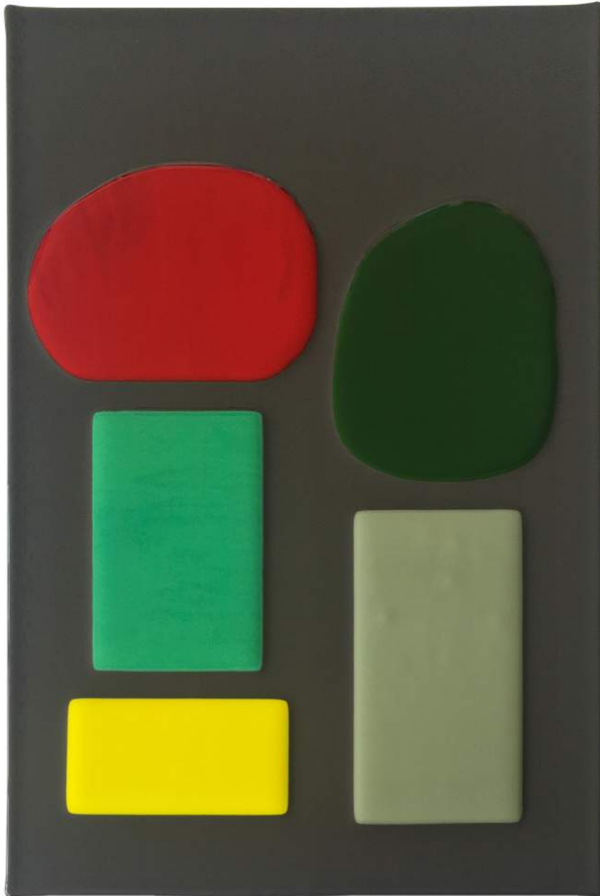
Emma Borland Form 16 2022 fused Oceanside and Youghioghney glass 61 x 41 cm $5,500