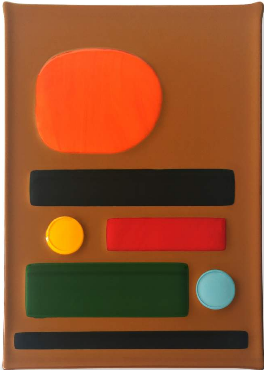
Emma Borland Form 3 2022 fused Oceanside and Youghioghney glass 41 x 31 cm $3,500