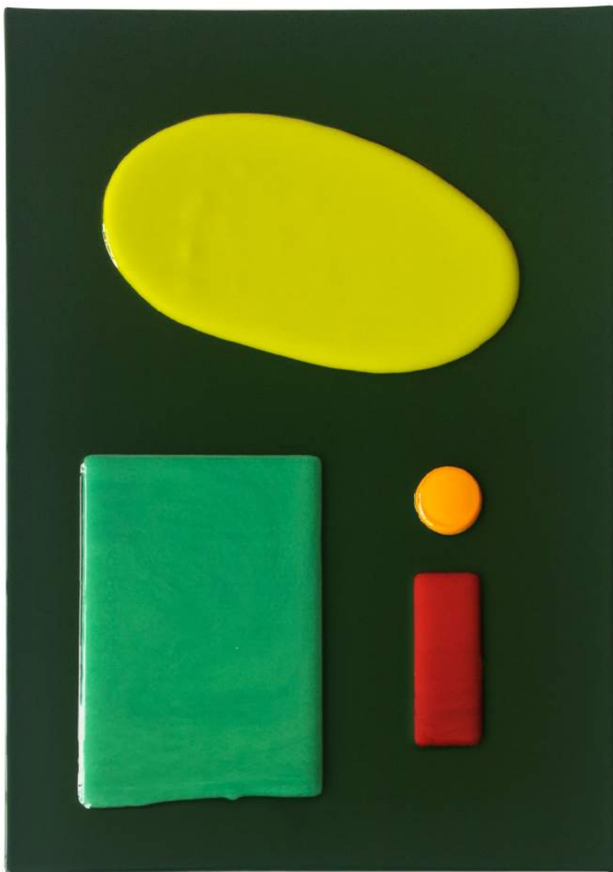
Emma Borland Form 7 2022 fused Oceanside and Youghioghney glass 41 x 31 cm $3,500