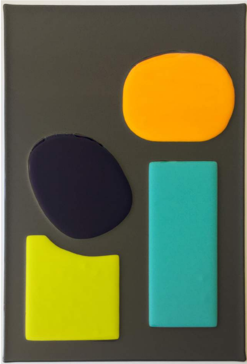
Emma Borland Form 15 2022 fused Oceanside and Youghioghery glass 61 x 41 cm $5,500