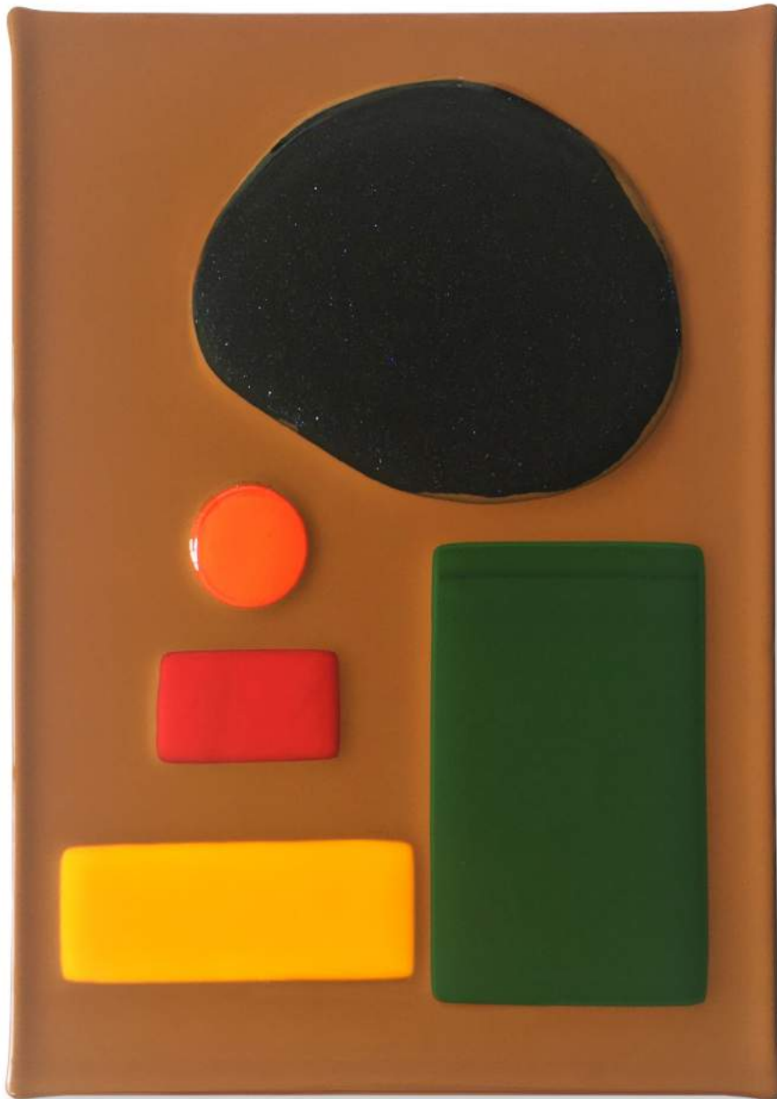
Emma Borland Form 1 2022 fused Aventurine, Oceanside and Youghioghenny glass 41 x 31 cm $3,500