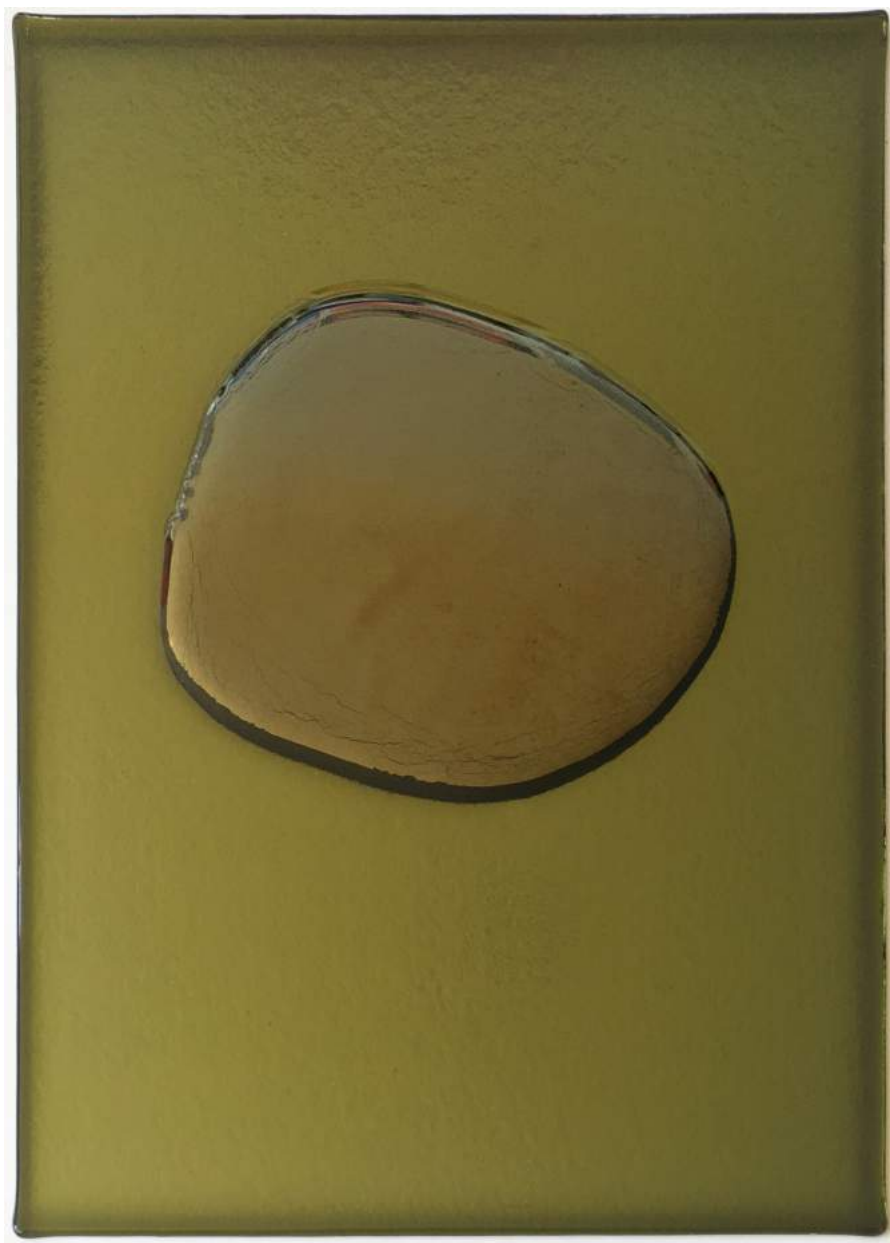
Emma Borland Form 4 2022 fused Oceanside and Youghiogheny glass, mirrored 41 x 31 cm $3,500