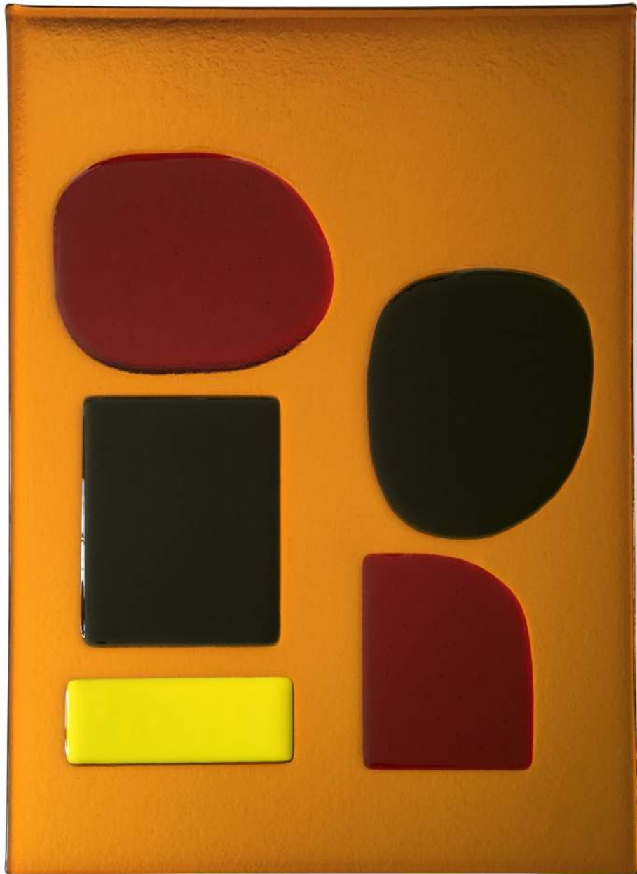
Emma Borland Form 13 2022 fused Oceanside and Youghiogheny glass, mirrored 61 x 41 cm $5,500