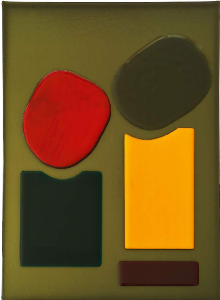
Emma Borland Form 12 2022 fused Oceanside and Youghioghney glass, mirrored 61 x 41 cm $5,500